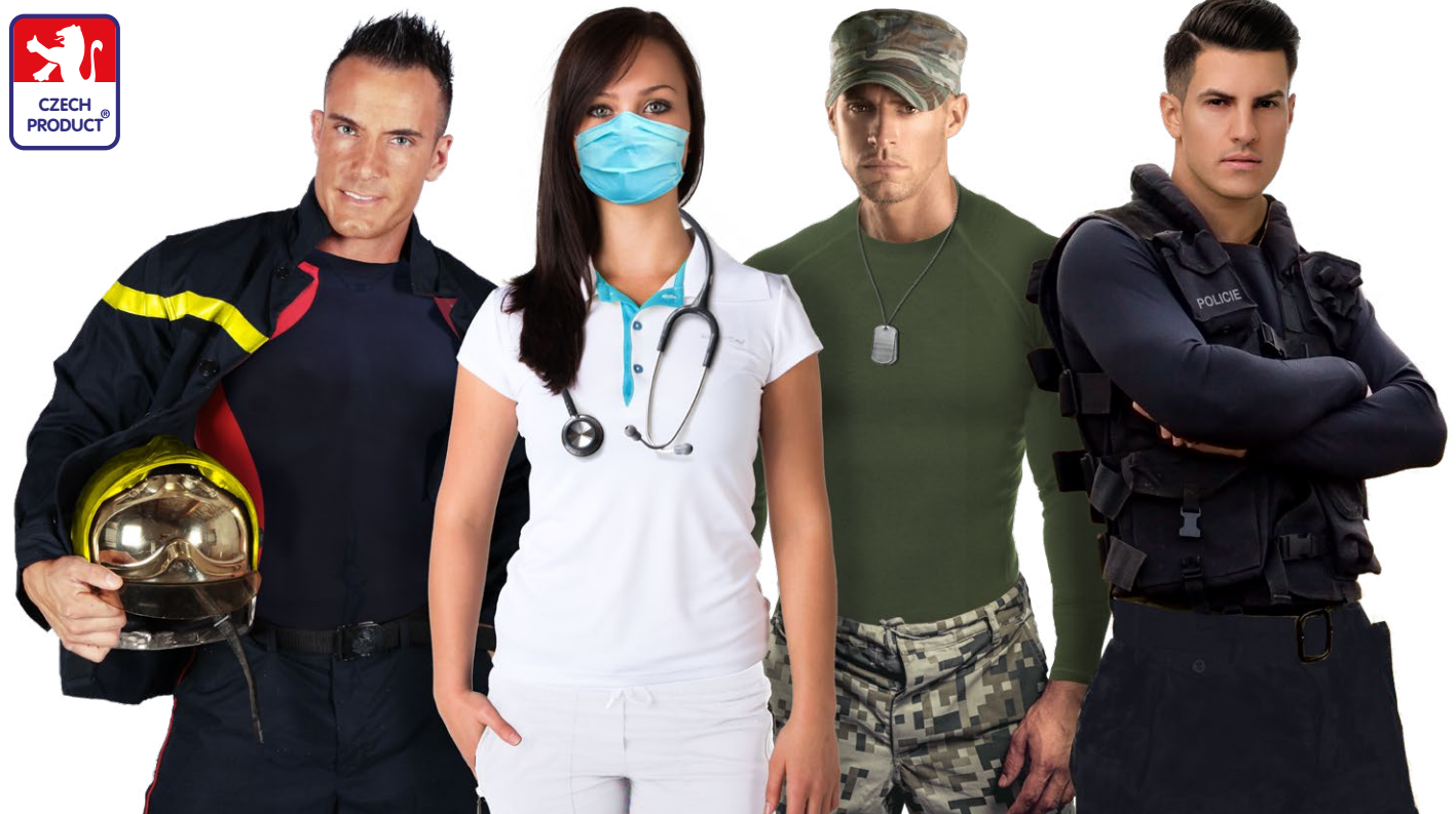
Microfiber contains nanosilver