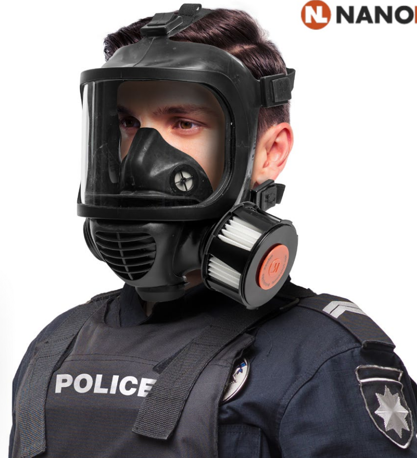
Nanofiber filter structure